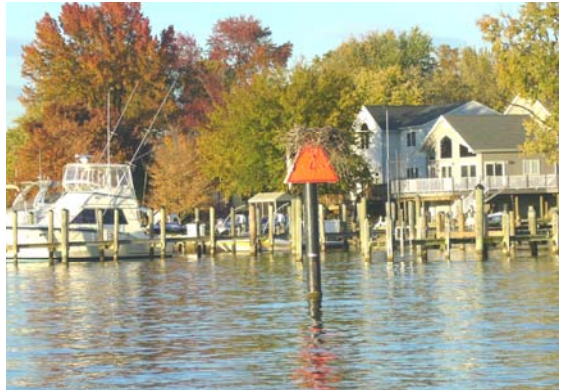
Fall is in the Air

Sandy Buxbaum from Crane Power Plant has requesting time to address members regarding community input for proposed changes to the facility.